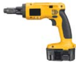
Screwgun: 2,500 RPM Max

It is not necessary to predrill holes with this fastener, saving time and labor.