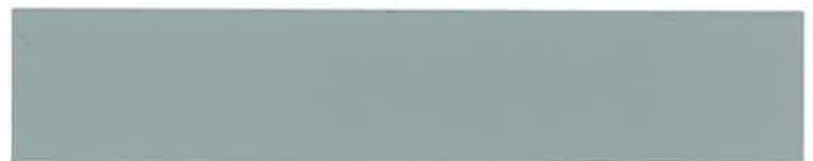
Pearl Gray IR .50 SRI 57