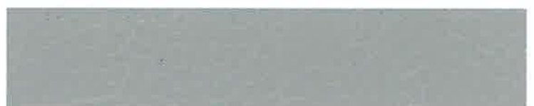
Pearl Gray Adobe