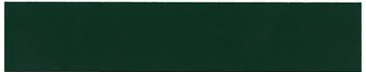
Evergreen IR .30 SRI 31

IR = Initial Reflectance • SRI = Solar Reflectance Index